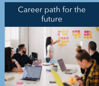
Career path for the future