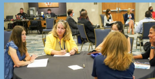
Talent and workforce mobility